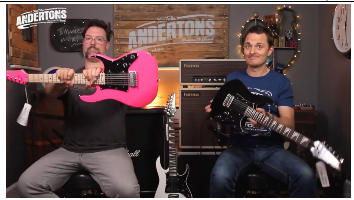
Figure 4. Chapman and The Captain, and their playful poses, in one of their video reviews

by filming their performances with multiple camera angles, while at the same time advertising a sponsor's guitar effect or collection of drum samples used in the video. Chapman's videos explicitly end with this humorous and unapologetic call to action: "Buy our stuff – we ship worldwide." Overall, the interplay between information, tips, tutorials, links, and branded content creates a symbiotic relationship between authors, sponsors, and the audience, which is unusual, if compared to traditional music education settings.