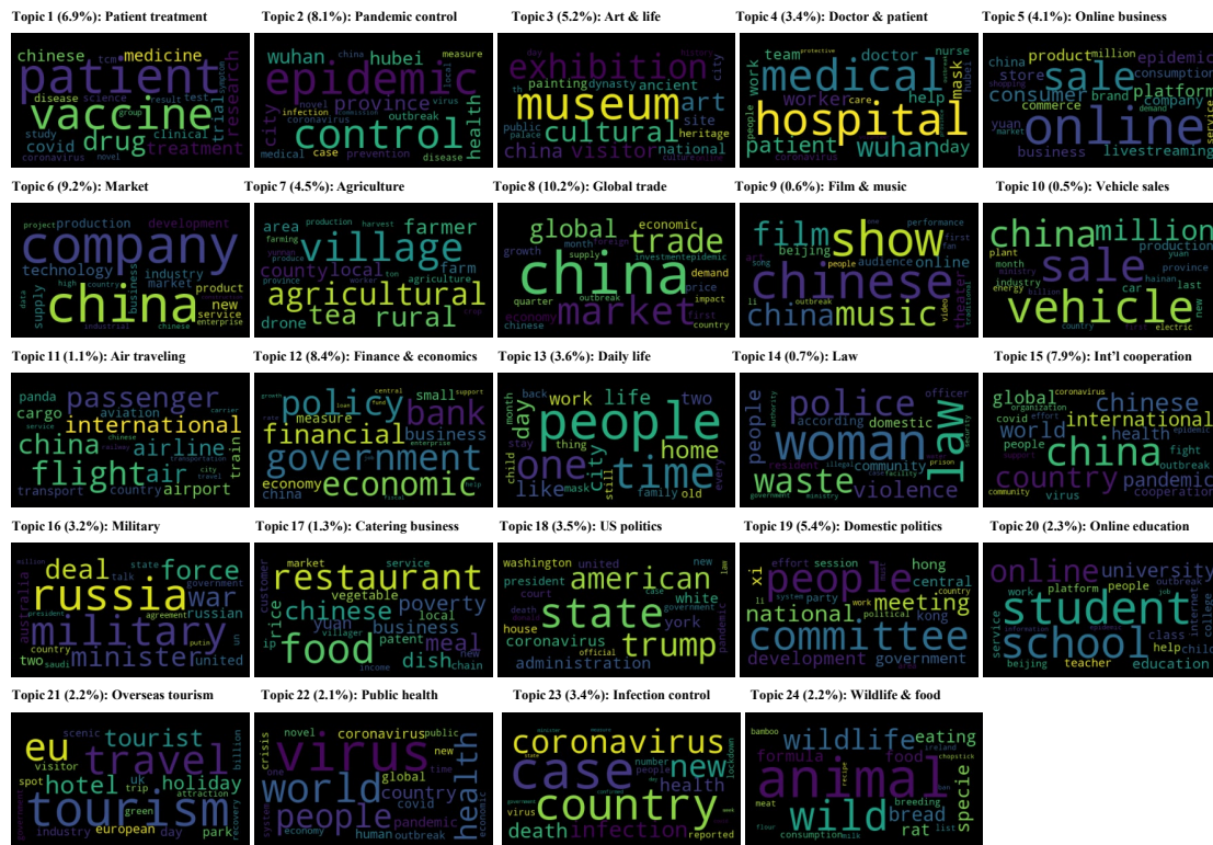
Figure 6. Topics with top 20 keywords in the reports of COVID-19 by China Daily