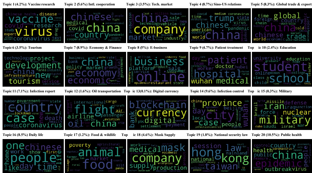
Figure 2. Topics with top 20 keywords in the Chinese coverage of COVID-19

First, the US and Chinese newspapers seem to take different perspectives to report the impacts of COVID-19 on economy/finance and health. In economy/finance-related topics, keywords such as “growth”, “government”, “measure” are found in the Chinese reports, while in the US reports, keywords like “loan”, “unemployment”, “crisis” are found. This may suggest that the two Chinese newspapers take a more positive view on the impact, since they may believe that under the guidance of government policies, China can restore economic development and promote financial revitalization. By contrast, the two US newspapers hold a less optimistic view, in which they seem to worry about how this health crisis may bring economic burdens to people’s life. In medical/health related topics, keywords like “team”, “nurse”, “volunteer” are found in the Chinese reports, while these words are not found in the US reports. This could possibly mean that the Chinese reports appreciate the effort made by the medical staff and volunteers in the fighting the pandemic, whereas this appreciation is less frequently found in the US reports. Taken together, these varied topical perspectives could contribute to the ways the newspapers in the two countries set their agenda for the pandemic coverage.