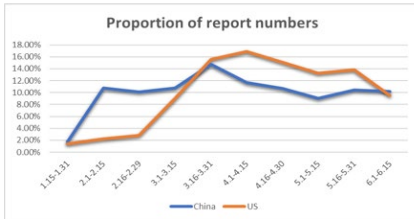
Figure 3. Proportions for the numbers of reports from US-China media across time