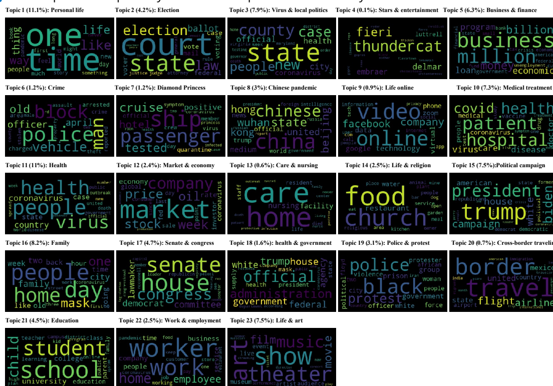
Figure 5. Topics with top 20 keywords in the reports of COVID-19 by The Washington Post

Aside from the dominant topics, modeling results show that the four newspapers take different perspectives towards the pandemic impact on domestic economy. For the two Chinese newspapers, topics related to market, economy or finance are not only shared but outstanding (top 3 regarding topic strength), where their keywords often include ones (e.g., “technology”, “development”, “growth”, “support”, “measure”) that depict the bright side of domestic economy, even though they connect to different economic aspects in