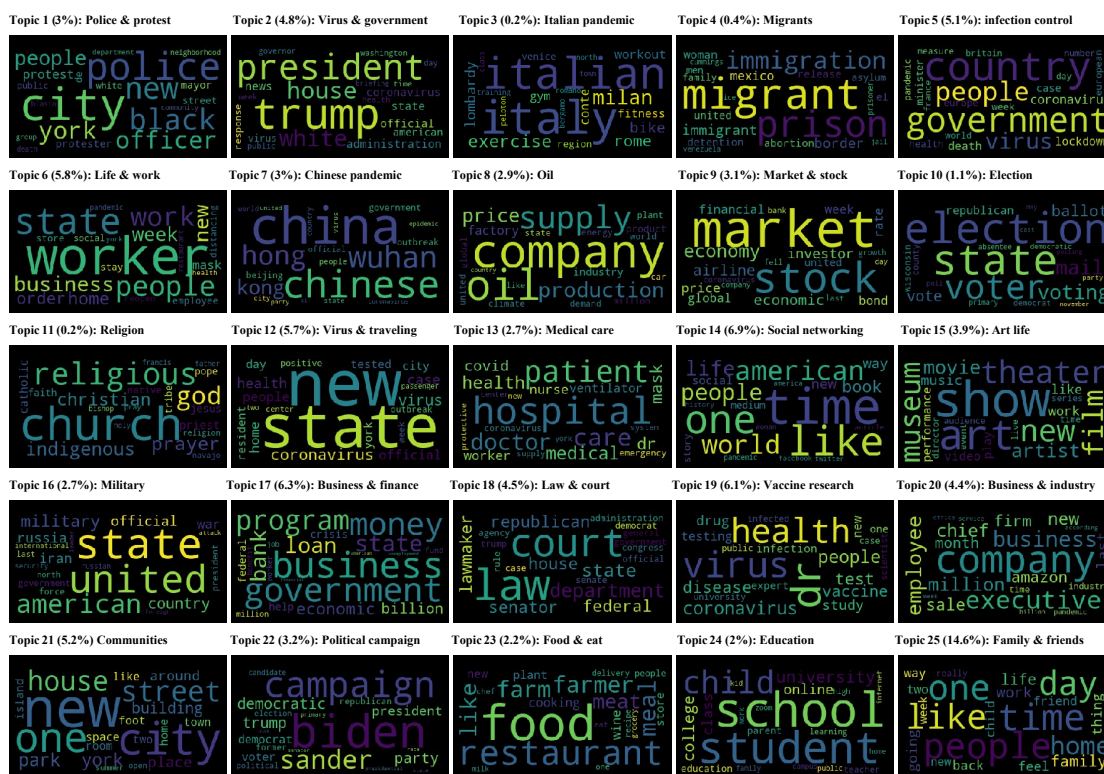
Figure 4. Topics with top 20 keywords in the reports of COVID-19 by The New York Times